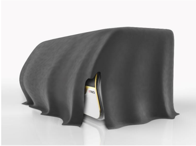
Posalux presents the new generation of ULTRASPEED machines at productronica 2015